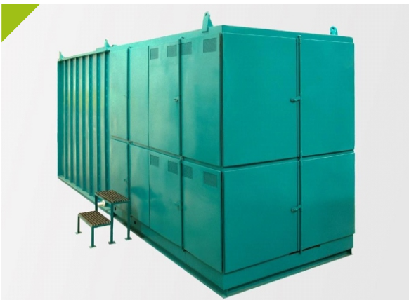
A Sustainable Innovative Membrane Bio Reactor Plant